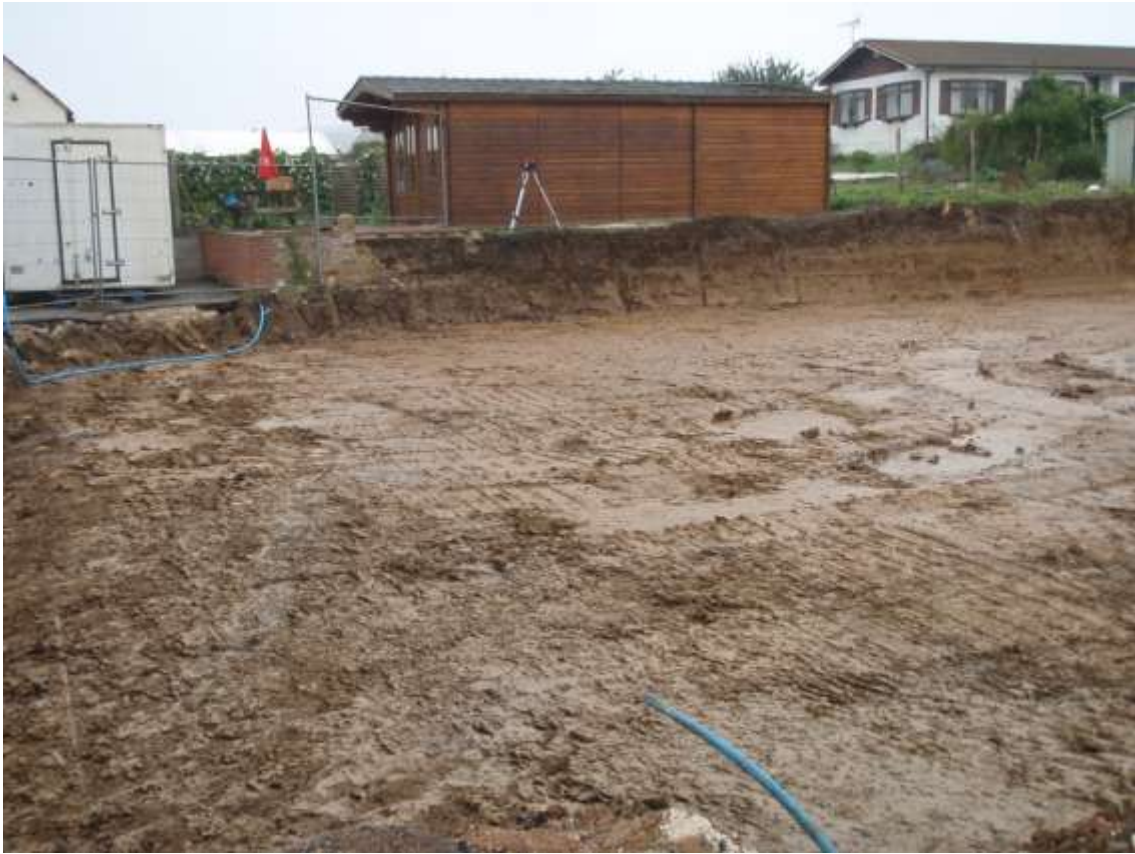
Plate 4. View of site reduction (looking N)