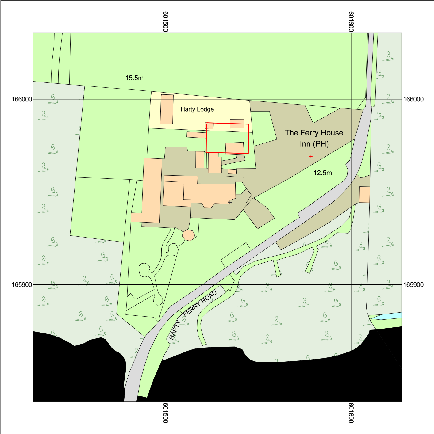
Figure 1 with area watched within red lines