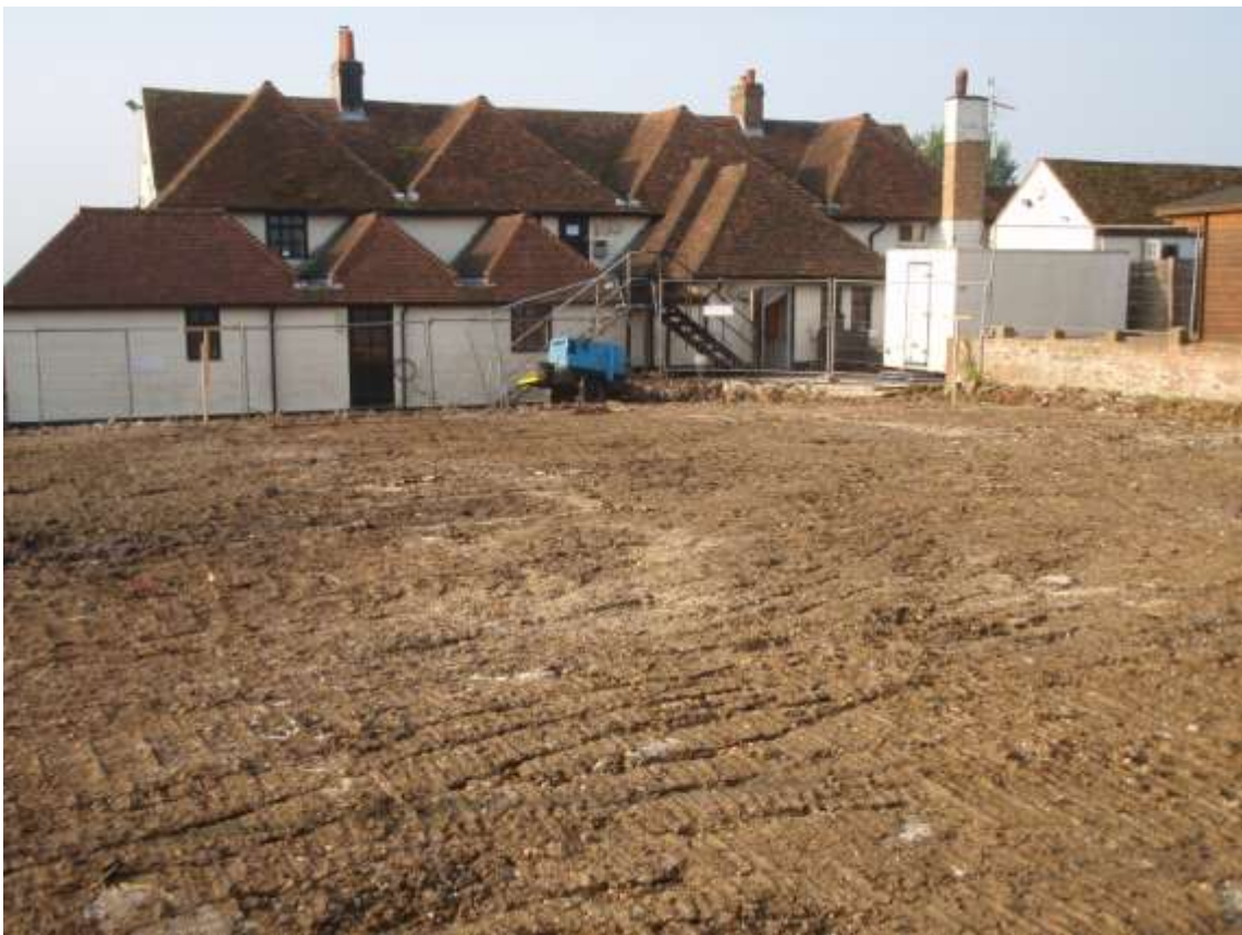
Plate 3. View of the site (looking SW)