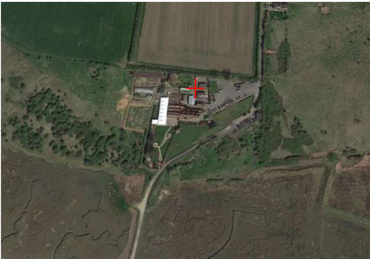
Plate 1. Aerial view of site (red target) showing the site prior to development.