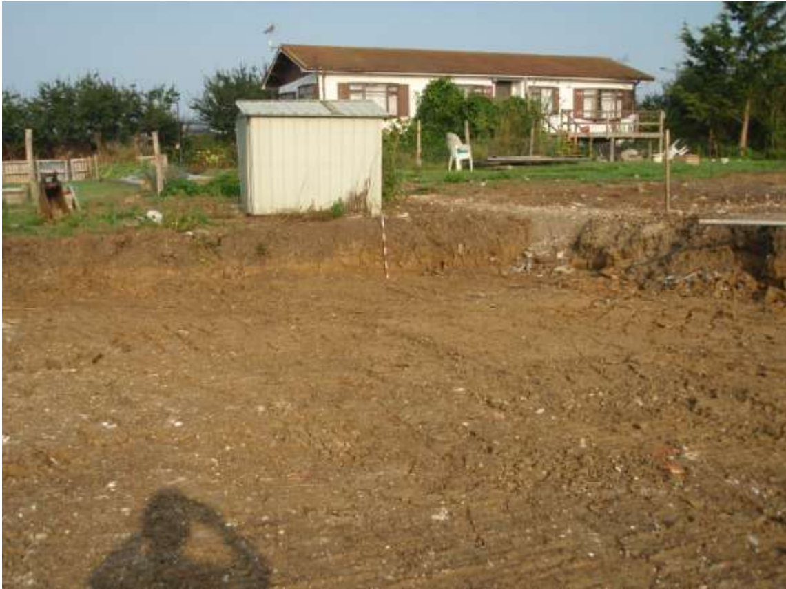
Plate 2. General view of site (looking NNW)