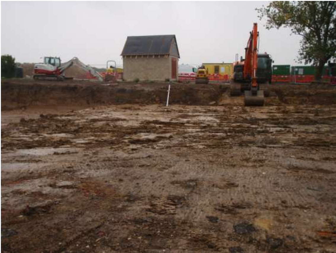
Plate 5. View of site reduction (looking E)